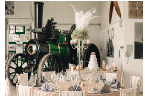
Dorothy Steam Engine