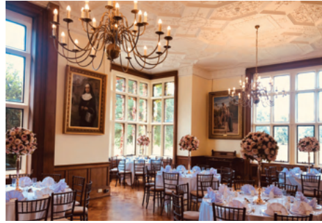
The Drawing Room