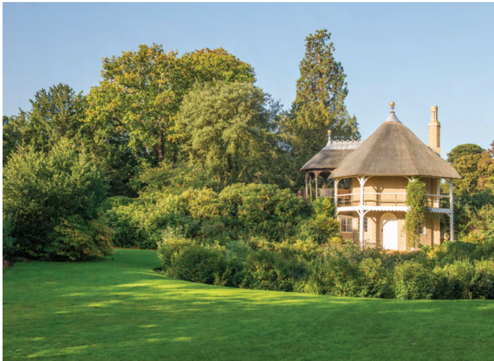
The Swiss Cottage