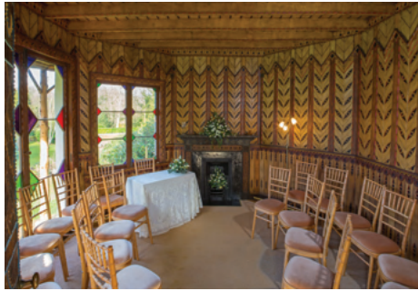
Swiss Cottage Ceremony