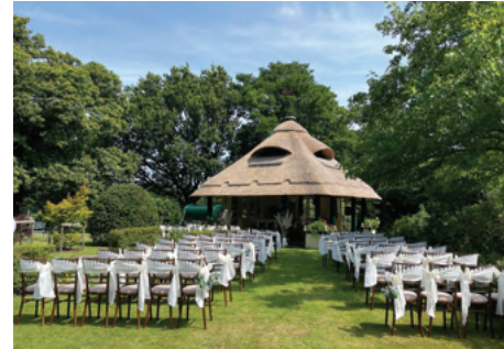
The Summer House

Within the grounds of Shuttleworth House we have The Summer House where we can offer outdoor ceremonies and drinks receptions. With spectacular views over the lily pond and The Sunken Garden, The Summer House creates a romantic setting for ceremonies of up to 100 guests.