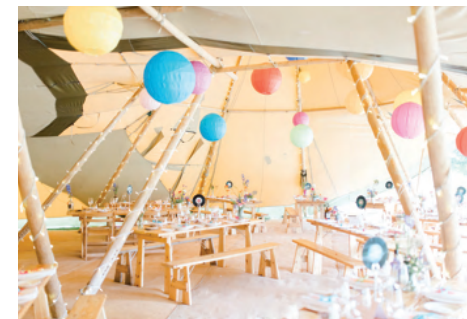
Zoe and Tom, 2019