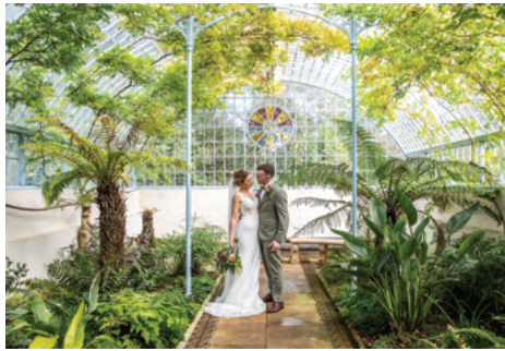
The Grotto & Fernery