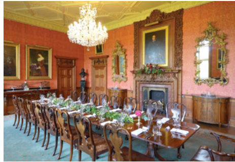
The Dining Room