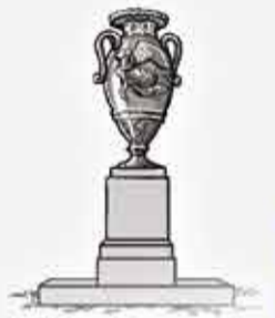
Night & Morning Vase