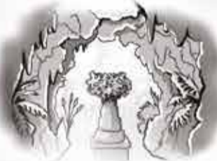
Grotto and Fernery