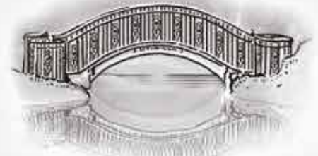
Moat Bridge, Cato & Sons